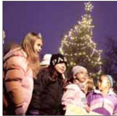
The Schweinfurt Elementary School chorus leads the crowd in Christmas carols at the Andrus Garden on Ledward Barracks, Dec. 3.